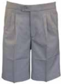
Shorts Senior Pleated