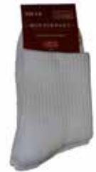
Sock Sport 2 pkt