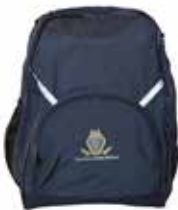
Unopak Prep - Yr2