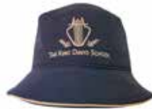
Bucket hat Prep-Yr5