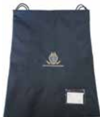
Library Bag Prep-Yr2