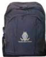
Airopak Yr3 - Yr6