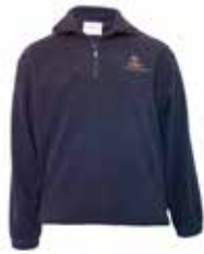
Polar Fleece Top