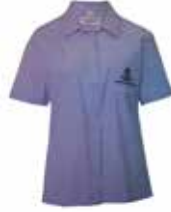
Blouse Short Sleeve