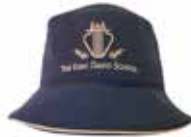
Bucket hat Prep-Yr5