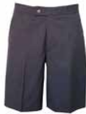
Shorts Senior fly front