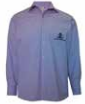
Shirt Long Sleeve