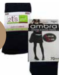
Tights Navy cotton or opaque

For current prices, please refer to www.bobstewart.com.au