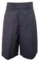
Shorts elastic back