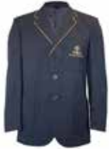
Blazer - Yrs 9 - 12