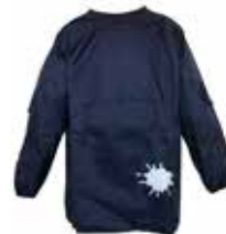
Art Smock Navy

For current prices, please refer to www.bobstewart.com.au