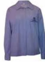
Blouse Long Sleeve