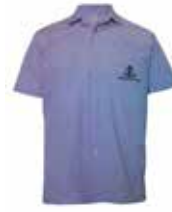
Shirt Short Sleeve