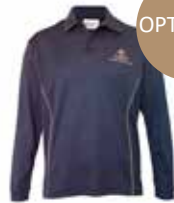
Polo Long Sleeve