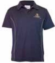
Polo Short Sleeve