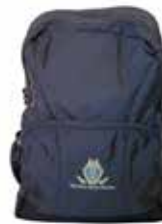
Chiropak Yr7 - Yr12