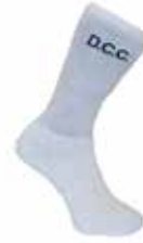
Sports Sock Anklet