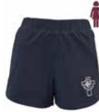
Sport Shorts with inner