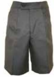
Junior Shorts w/elastic