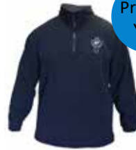
Polar Fleece Top