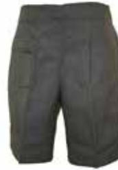
Pull on Shorts