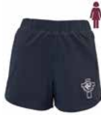
Sport Shorts with inner