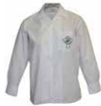
Shirt Long Sleeve