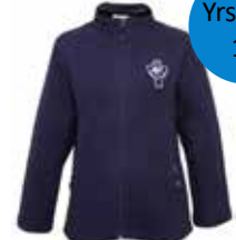
Polar Fleece Jacket