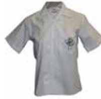
Shirt Short Sleeve