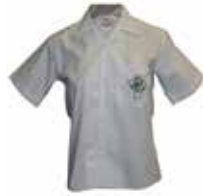
Shirt Short Sleeve