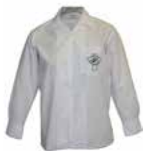
Shirt Long Sleeve