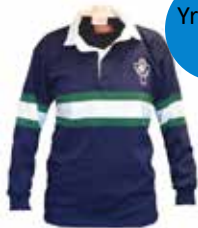
Rugby Top Senior