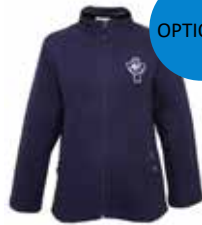
Polar Fleece Jacket