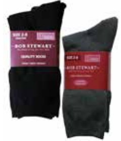
Sock Crew 3pk