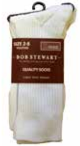
Sock Anklet 2pk