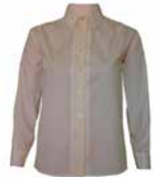
Blouse Cream L/S