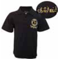
ELC Polo Top