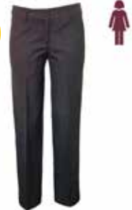
Tailored Pants Pinhead