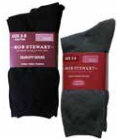
Sock Crew 3 pk