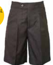
Shorts Primary Elastic

For current prices, please refer to www.bobstewart.com.au