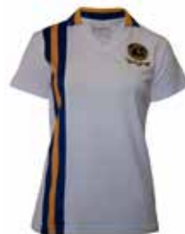
Sport Polo Girls