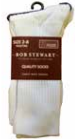
Sock Anklet 2pk