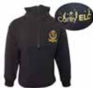
ELC Polar Fleece Top