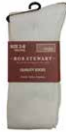
Sock Kneehigh 2pk