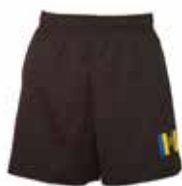
Sport Shorts Girls