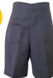
Pull on Shorts