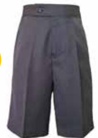
Junior Shorts w/elastic