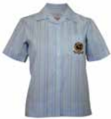
Blouse Short Sleeve