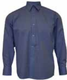
Shirt Blue L/S