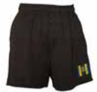
Sport Shorts Taslon