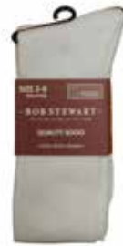
Sock Kneehigh 2pk