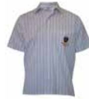
Short Sleeve Shirt