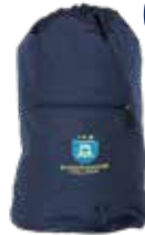
Soft Sports Bag