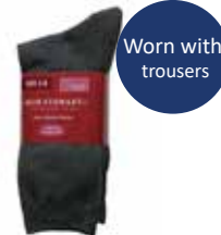
Socks Grey 3 Pkt