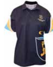
Sports Academy Polo

Sports Academy Students Only No Sports Polo required