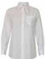
Blouse Long Sleeve