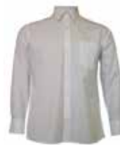
Shirt Long Sleeve