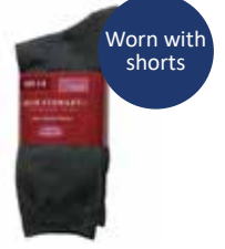
Socks Grey 3 pkt