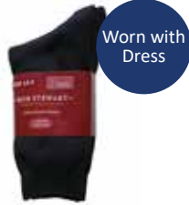
Socks Navy 3pkt