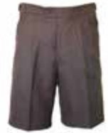
Shorts pleat front