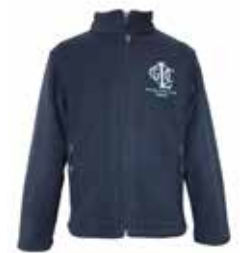
Polar Fleece Top