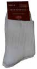
Sock Sport 2 pkt