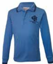
Polo Long Sleeve