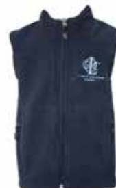
Polar Fleece Vest