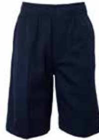
Shorts Pull On Gabardine