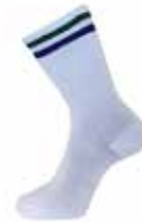
Sports Sock 2 pkt