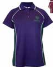
Polo Girls fit