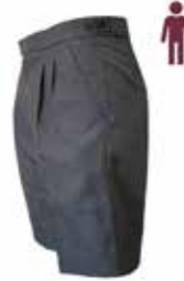
Shorts pleat front