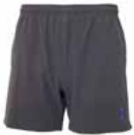
Sport Shorts Unisex