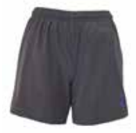
Sports Short Girls