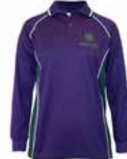
Polo Long Sleeve