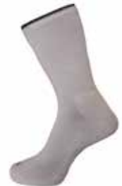
Socks White 2 pkt