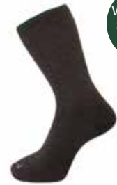
Socks Grey 2 pkt